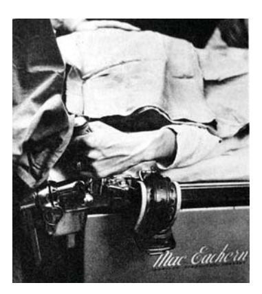
Figure #1: "mothers must have their hands strapped down so they won't touch sterile sheets"

more difficult than the surgical patients. The fully conscious labor patient had to made to stay absolutely still and not touch anything (especially not the obstetrician's gloves by grabbing his hand!), lest she contaminate the 'sterile field'. One method was to secure the mother's hands to the side of the delivery table with leather wrist restraints and put her legs in stirrups. While leather straps and stirrups improved the obstetrician's control of patients in the delivery room, it was still terribly difficult to meet the physical and emotional needs of a fully-conscious and physically able woman in 2<sup>nd</sup> stage labor, while the physician was focused on performing a sterile procedure. This conflict of needs would soon be decided in favor of surgical sterility by the obstetrical profession.