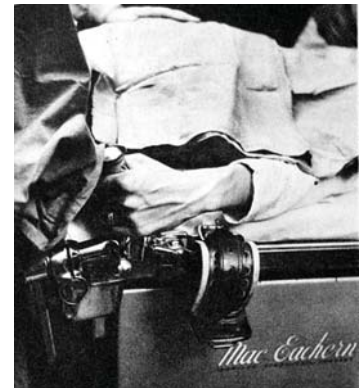
Figure #1: “ mothers must have their hands strapped down so they won’t touch sterile sheets ”

To guarantee absolute sterility and insure a faultless aseptic technique during childbirth was more difficult than the surgical patients. The fully conscious labor patient had to made to stay absolutely still and not touch anything (especially not the obstetrician’s gloves by grabbing his hand!), lest she contaminate the ‘sterile field’. One method was to secure the mother’s hands to the side of the delivery table with leather wrist restraints and put her legs in stirrups. While leather straps and stirrups improved the obstetrician’s control of patients in the delivery room, it was still terribly difficult to meet the physical and emotional needs of a fully-conscious and physically able woman in 2 nd stage labor, while the physician was focused on performing a sterile procedure. This conflict of needs would soon be decided in favor of surgical sterility by the obstetrical profession.